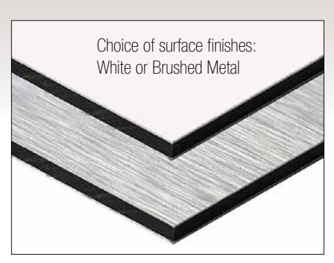
Choice of finishes