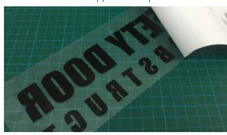
Peeled and ready for installation