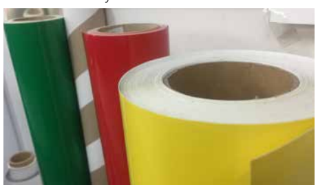
A variety of colours in stock