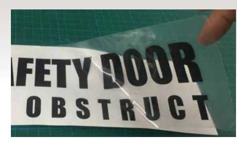
Mounted onto clear application tape