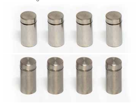
Polished and brushed standoffs available in 12mm