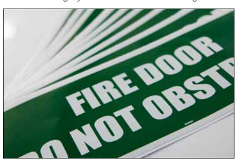
Permanent adhesive for long term install