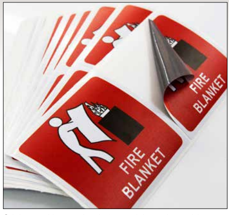
Stickers with grey back for no 'show through'